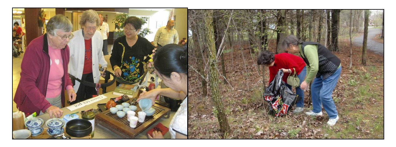
Chinese seniors introduce tea drinking art in the seniors' residence